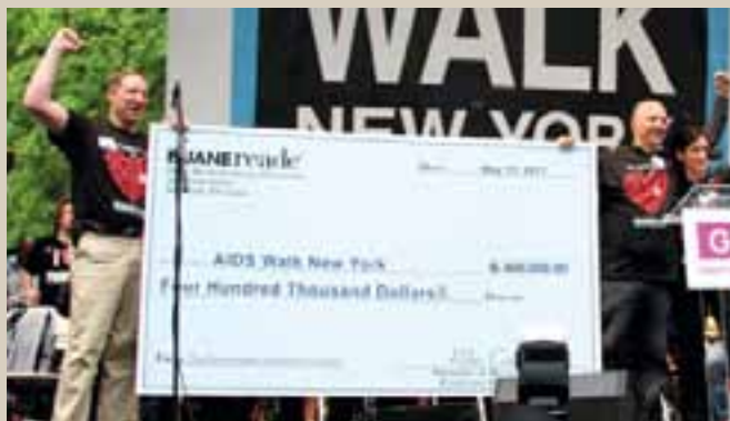
An extraordinary contribution of $400,000 from Duane Reade helped us exceed $6.2 million.