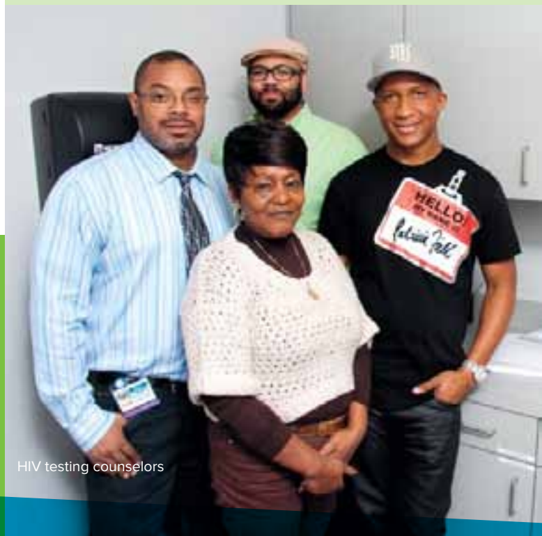
HIV testing counselors

and care coordinators immediately available to those who required them. By making HIV tests commonplace at high visibility events and locations, we normalize what for many is a foreign and frightening experience. Fear and uncertainty about HIV is replaced with knowledge, support, and treatment.