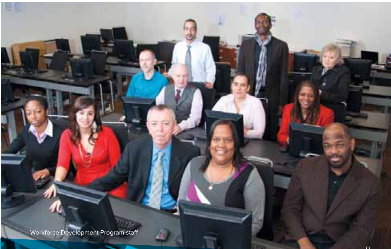
Workforce Development Program staff

seeking and working in a modern office, with a wardrobe of professional attire available to help transition clients to complete professional independence.