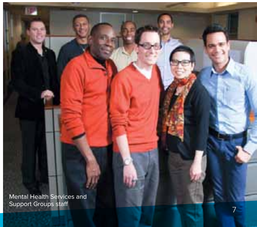
Mental Health Services and Support Groups staff

when they need it most: at the moment of intervention and as part of a continuum of care. By making these vital medicines readily available, we protect both our clients' health and the health of their communities.