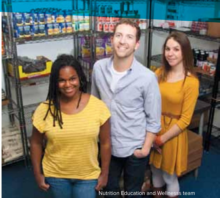
Nutrition Education and Wellness team

HIV is a disease of the body, but its effects and cofactors reach into every aspect of a client's life. That's particularly true when chemical dependence inhibits adherence to treatment and spurs the transmission of HIV to partners. The mental health services and support groups at GMHC run the gamut, from programs to help keep clients clean and sober to discussion groups that connect isolated individuals and build profound, life-affirming relationships.