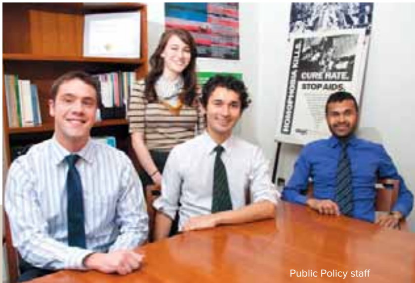
Public Policy staff

Since 1985, the uncertainty of transmission factors and a lack of accurate tests brought about a ban against men who have sex with men from donating blood. Surprisingly, the ban still stands. This discriminatory practice reasserts old prejudices and propagates misconceptions about who is at risk and the proper way to curb the spread of HIV. Working with both the bleeding disorders community and the AIDS advocacy community, GMHC seeks to end this antiquated ban. Defeating this longstanding prejudice against gay men will help to increase the supply of vital blood products while maintaining the strictest standards of safety for all.