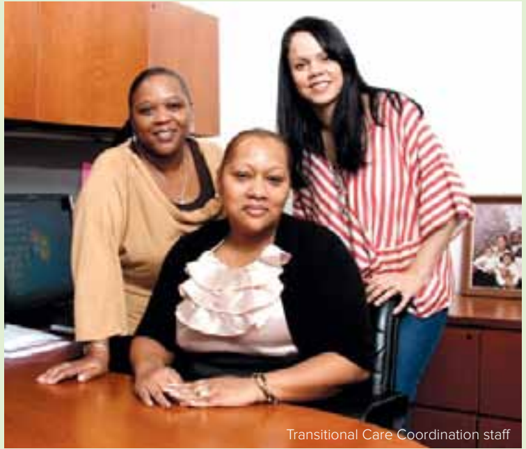
Transitional Care Coordination staff

Access to stable housing is a public health imperative. When a person's basic need of shelter is unmet, their risk of HIV transmission can be compounded by many factors: prostitution, intravenous drug use, and mental health issues. The Transitional Care Coordination Program serves clients on the brink of homelessness or currently homeless with tools and resources to access government benefits, entitlements, and housing services. These vital programs stem the risk factors associated with homelessness before they become inescapable detriments.