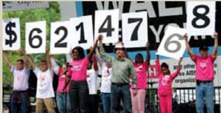
Thanks to 45,000 people, AIDS Walk raised $6,214,768.