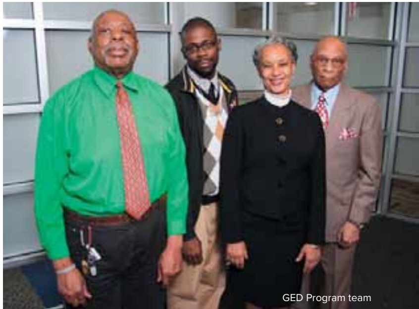
GED Program team

Completing a basic education is difficult for underserved populations. Add an HIV diagnosis to social disadvantages, and a person's likelihood of completing a high school level of education drops dramatically. The GED program at GMHC prepares clients for this all-important equivalency exam, opening new, better avenues of sustained employment and a dramatically improved quality of life.